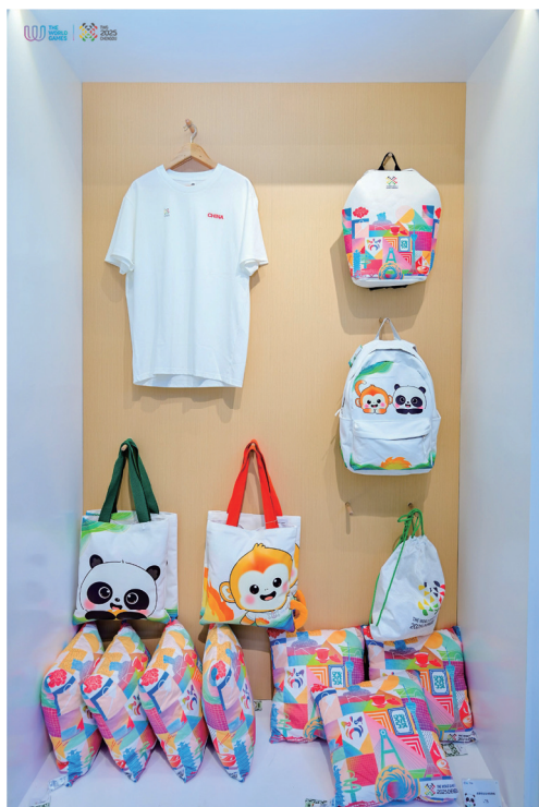
Top Left: Commemorative T-shirt Top Right: Silhouette Backpack Middle: Mascots-Themed Canvas Bag/Backpack Bottom: Ice Silk Throw Pillow