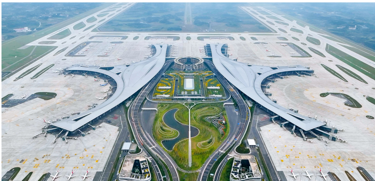
Chengdu Tianfu International Airport

Phoebe zhennan trees. Here, diverse life thrives, exemplifying the harmonious coexistence between humanity and nature.