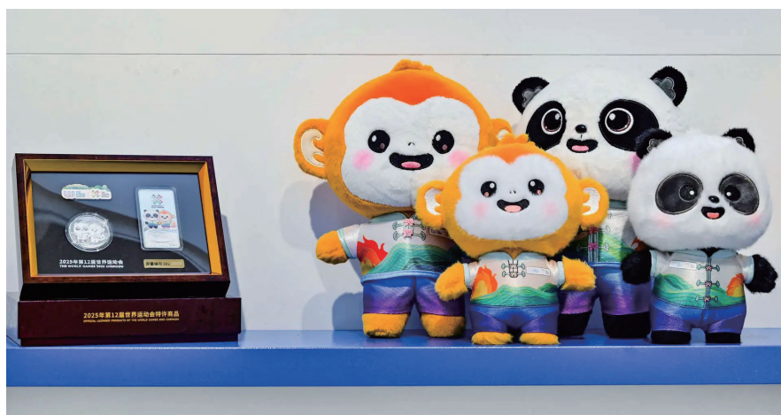
Left: [Impression: Chengdu] Limited Edition Collector's Ornaments Right: Plush Mascot Toys

The licensed products incorporate rich Tianfu cultural elements and embody the profound connotation of Tianfu culture. They are not only the material embodiment of TWG spirit but also a perfect combination of cultural exchange, emotional resonance, and marketing, thus playing an important role in promoting the development of The World Games and the spreading of Tianfu culture.