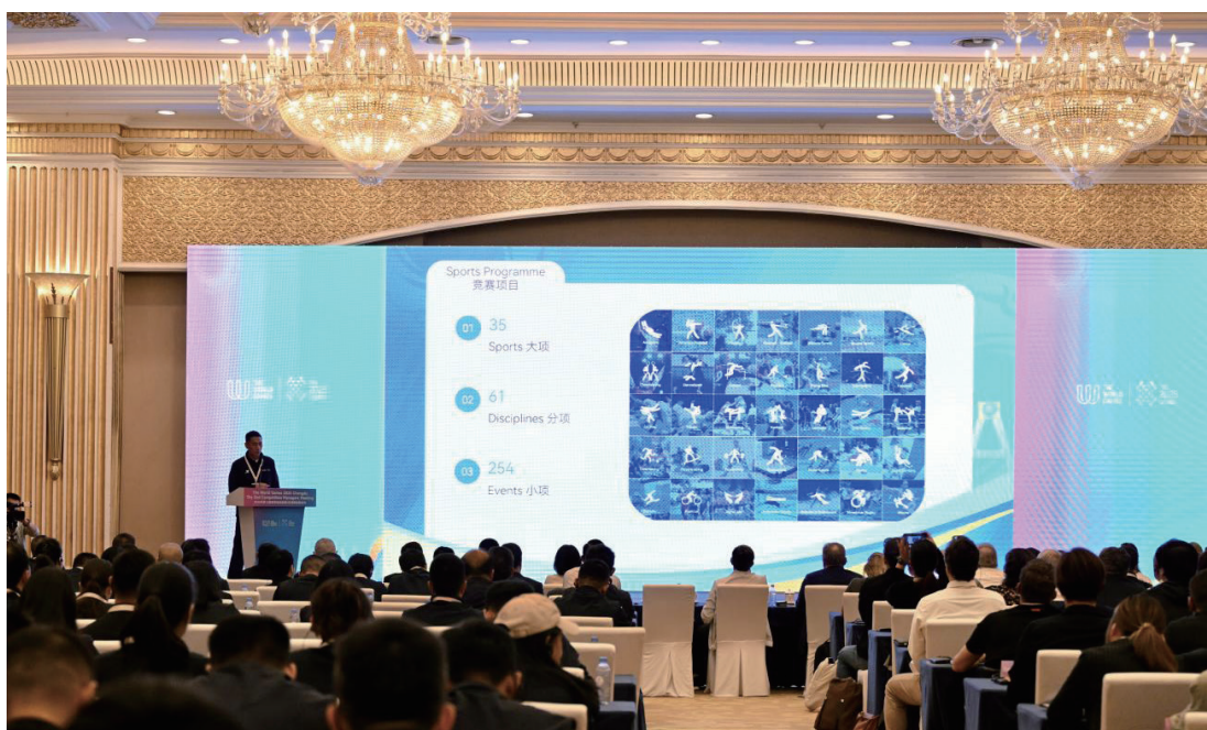
Photos of the conference venue

The 2nd CMM was held in Century City International Conference Centre on 23 and 24 October. Nearly 100 guests, including the IWGA ExCo members, the IWGA partners, the competition managers of IFs and the representatives of the host city of the next TWG, gathered in Chengdu, holding discussions on the preparations for TWG 2025 Chengdu with representatives from the General Administration of Sport of China, the China Disabled Persons' Federation, the Sichuan Provincial Workgroup for the Promotion and Coordination of TWG 2025 Chengdu, and the Executive Committee of TWG 2025 Chengdu.