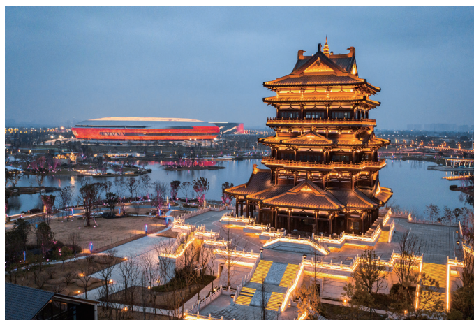
Dong'an Lake Sports Park