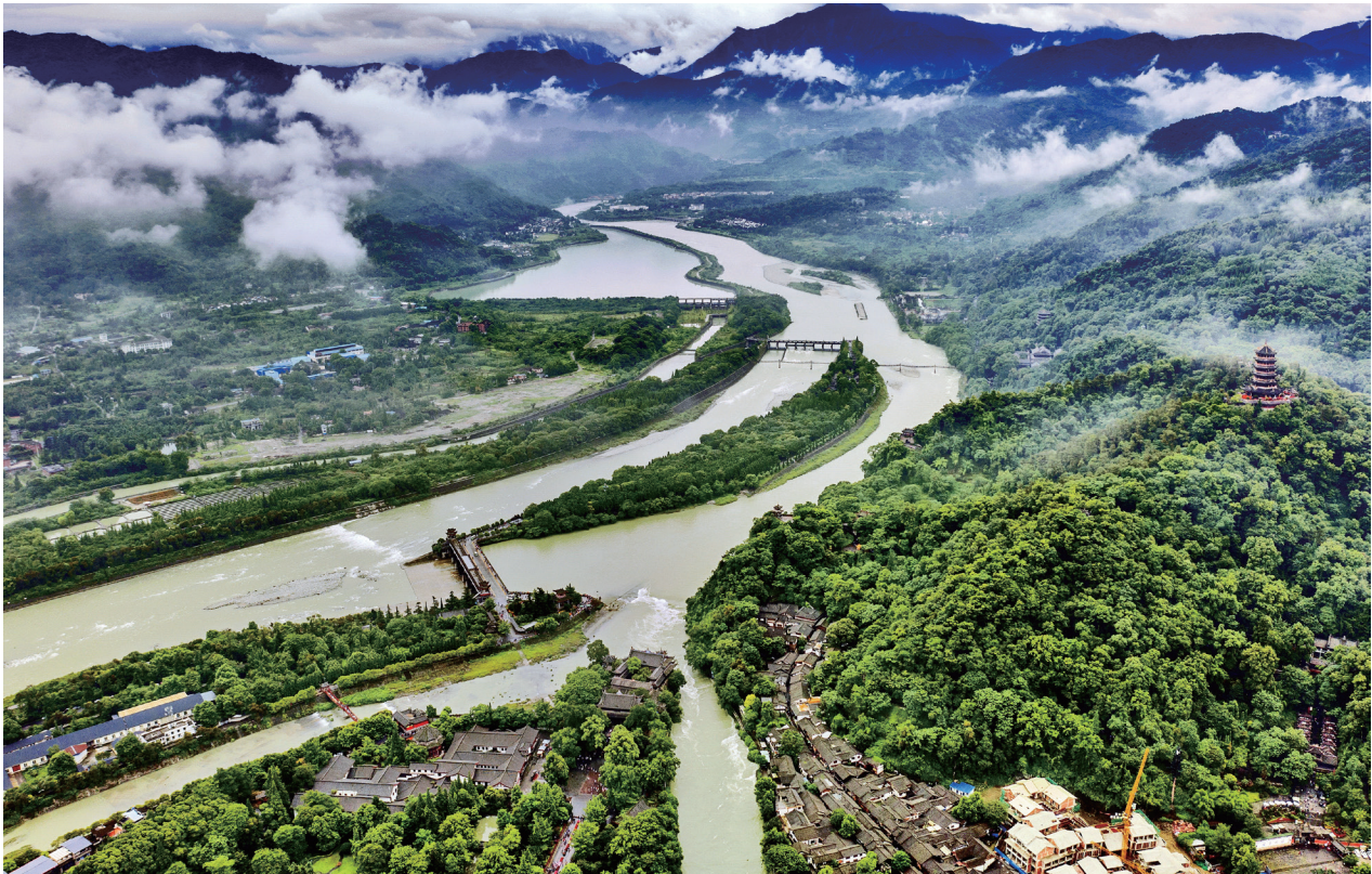
Dujiangyan Irrigation System

such as Jiuzhaigou Valley, Huanglong Scenic and Historic Interest Area, and Daocheng Yading Scenic Area, inspire awe. Iconic sites like Mount Emei, Mount Qingcheng, and Jianmen Pass captivate visitors. Sichuan is also the hometown of giant pandas and a globally significant biological gene repository. Nearly 2,000 giant pandas live here, alongside rare wildlife such as Sichuan golden snub-nosed monkeys, snow leopards, white-lipped deer, dove trees, Chinese yews, and