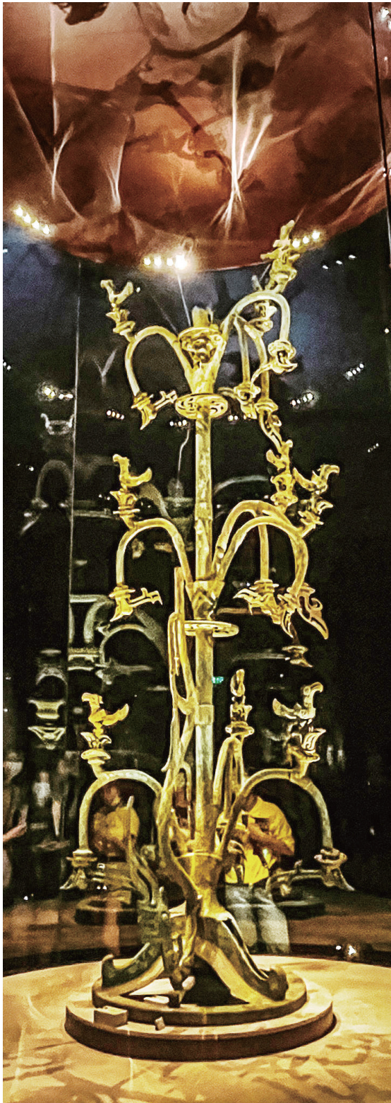
Sanxingdui Bronze Sacred Tree

Sichuan is located in southwestern China, in the upper reaches of the Yangtze and Yellow Rivers. Spanning an area of 486,000 square kilometres, it has a registered population of over 90 million and a GDP exceeding CNY 6 trillion. It has been reputed as the “Land of Abundance” since ancient times.