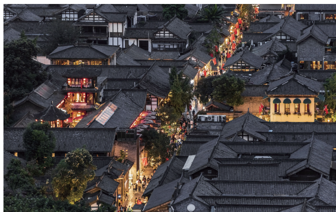
Taikoo Li Chengdu

Today's Chengdu values opening up with global vision. In total, 23 countries have been approved to establish consulates in Chengdu. And the city has established sister-city and friendship city relations with 113 cities around the world, and trade relations with 235 countries/regions worldwide. Chengdu is the third city having two international airports on the Chinese mainland, following Shanghai and Beijing, and the 19th city with two 4F airports in the world. It has opened 71 regular international and regional flight routes, covering both passenger and freight services. In addition, it is linked to 112 overseas cities through its international freight train services.