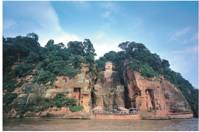
Leshan Giant Buddha