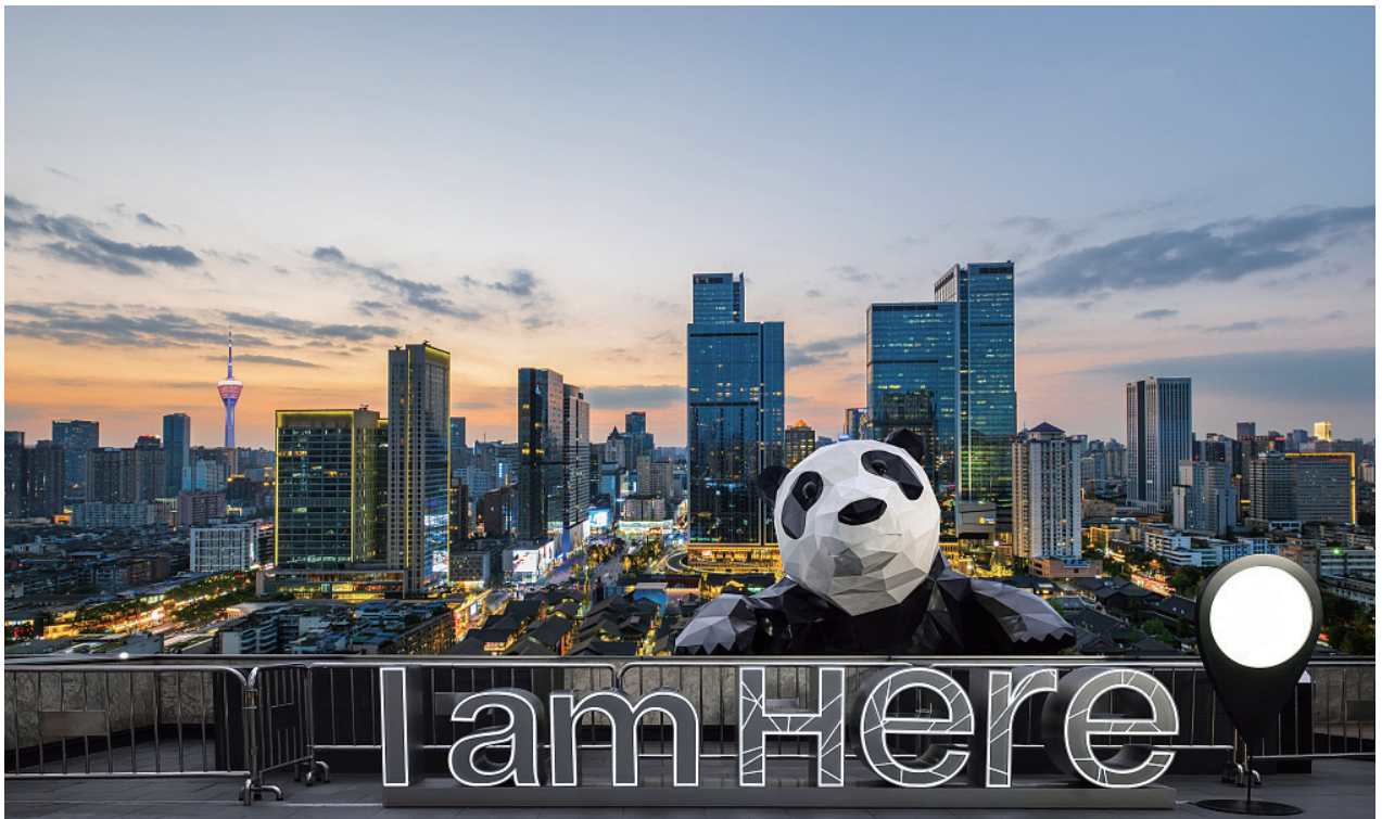
Streetscape of Chengdu

Chengdu is the hometown of the Giant Pandas and enjoys over 4,500 years of civilisation history and more than 2,300 years of history as a city, manifesting a perfect mixture of history, culture and modernity. Being the capital of Sichuan Province and a central city in southwest China, Chengdu covers an area of 14,300 square kilometres and has a permanent population of 21.4 million, which has turned it into a mega-city known to the world. It is also an important centre of economy, science and technology, finance, cultural creativity, and international exchanges in China, and an international hub for comprehensive transportation and communications.