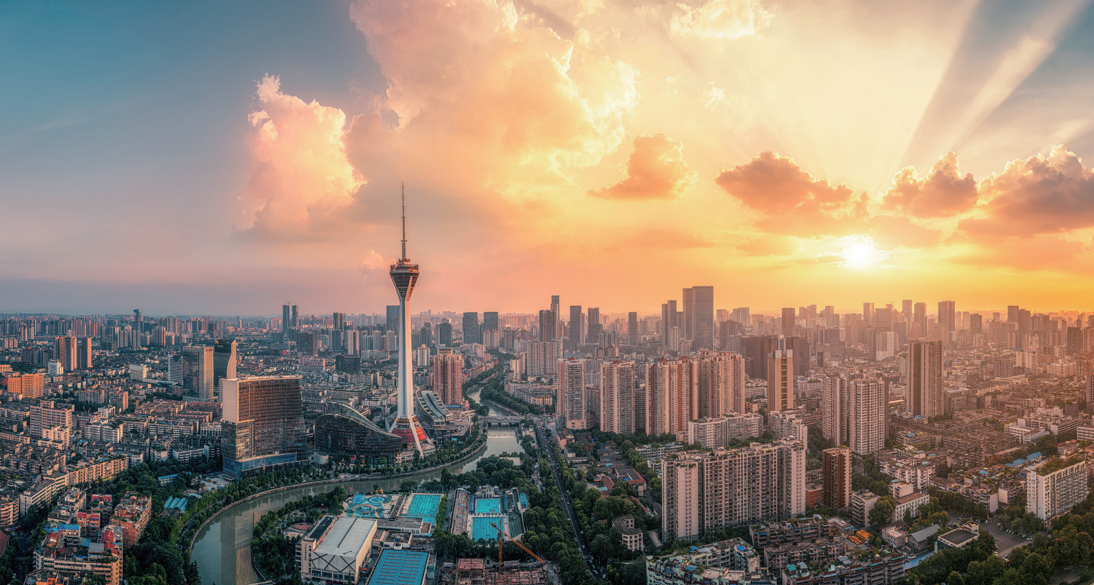
Streetscape of Chengdu