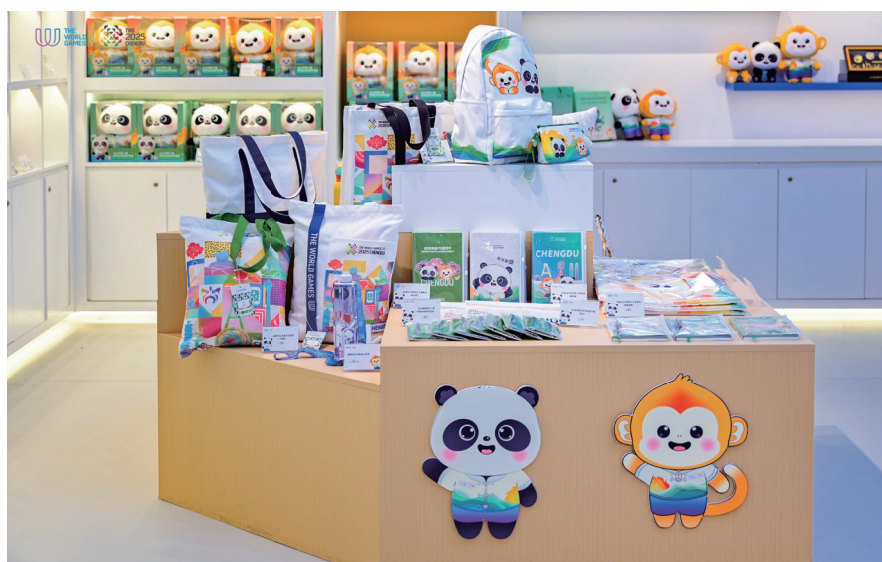
Stationery Section: Mascots-Themed Backpack/Canvas Bag/Notebook/Ballpoint Pen