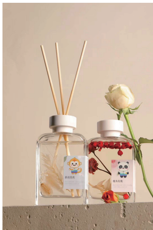
Nature & All Things: Aromatherapy Scents